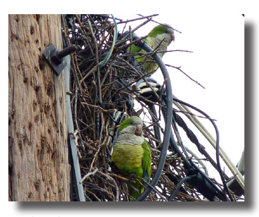
Monk parakeet nest